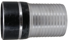
beveled end STB50