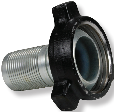
3" and 4" HUM206400CS