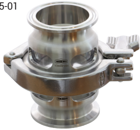
single pin clamp