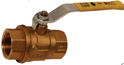
female NPT x female NPT