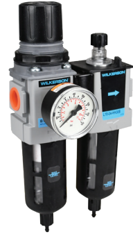
with transparent bowl and guard