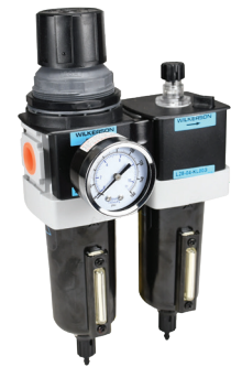
with metal bowl