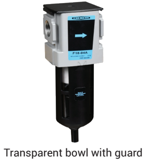
Transparent bowl with guard